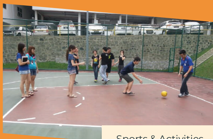
Sports & Activities