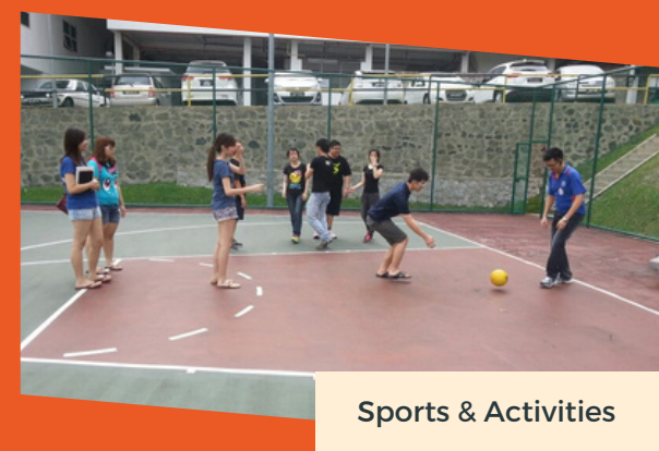
Sports & Activities

Sunway College Kuching students will be exposed to a variety of extra-curricular activities in addition to their academics to be developed into well-rounded individuals.