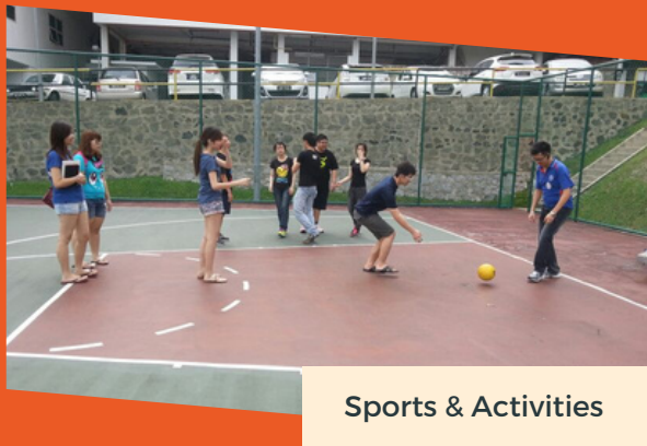
Sports & Activities

Sunway College Kuching students will be exposed to a variety of extra-curricular activities in addition to their academics to be developed into well-rounded individuals.